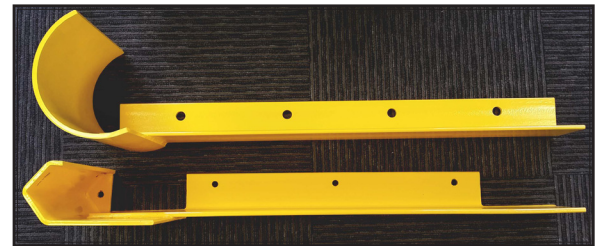
Standard Rack Protector vs. Space Saving profile