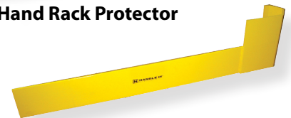
Right Hand Rack Protector