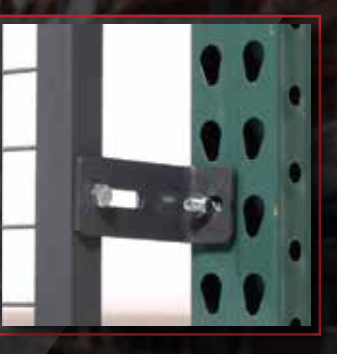
RackBack® Safety Panels mount to the back of pallet racks stopping items from falling. Protect personnel while containing inventory.