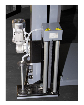
Electromagnetic film tension with easy film threading

speed, carriage speed going up, carriage speed going down, film tension.