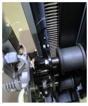
Rack & Pinion carriage drive system for added reliability