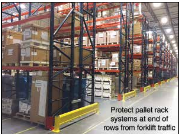
Protect pallet rack systems at end of rows from forklift traffic

Our HANDLE-IT Heavy Duty Barrier and Guard Rail system will protect your valuable product storage systems and offices along with machinery, electrical boxes and personnel from forklifts and other material handling equipment. Designed to create a safe and efficient work environment at an economical cost.