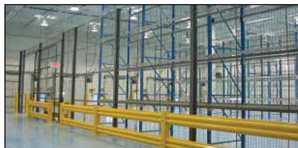
RackBack Safety Panels protect high volume areas for your total solution