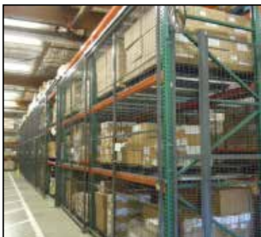
Wire Crafter FDA approved systems create efficient and effective storage spaces.