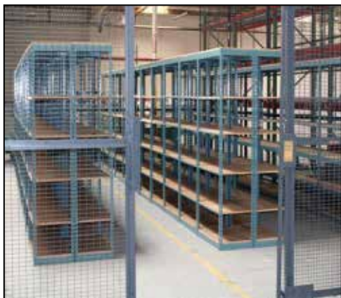
100% Secure with added visibility.

RackBack Safety Panels mount to the back of pallet racks stopping items from falling. Protect personnel while containing inventory.