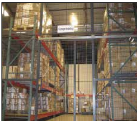
Easy Slide Secure Doors allow both forklift and personnel traffic

SAVE 30% - 40% ON NEW & USED - CALL NOW!