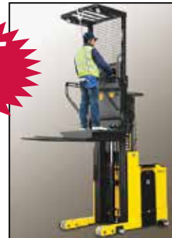
Strong Overhead Guard