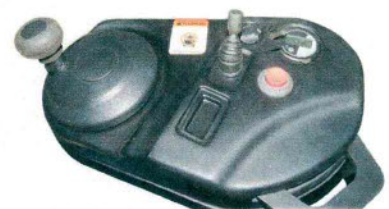
Operators Control Pod