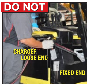
DO NOT CONNECT CHARGER to TRUCK (Loose End to Fixed End)